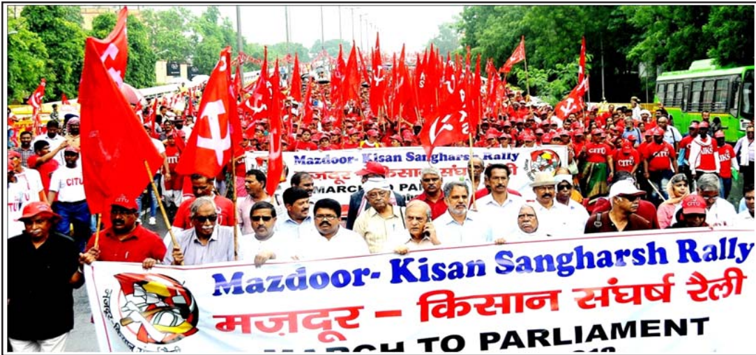
The Huge Procession from Ramlila Ground to Parliament Street