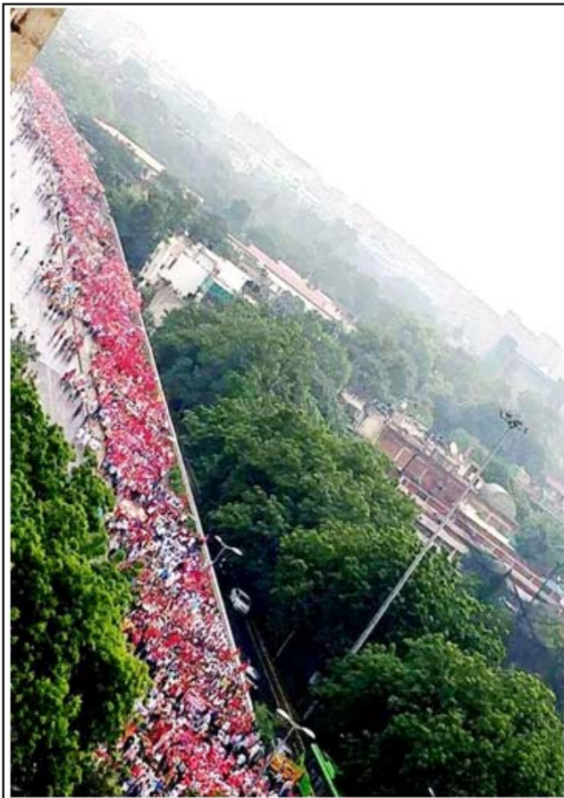
An aerial view of the March

Sea of Red in city as farmers rally for rights - ASIAN AGE