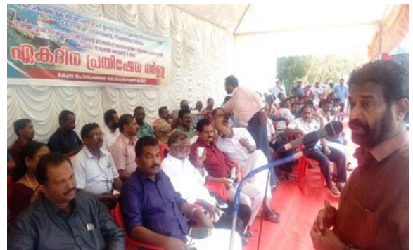
Dharna at Kochi