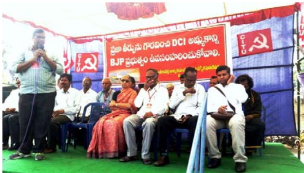
Public meeting at Visakhapatnam