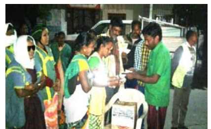
People casting votes